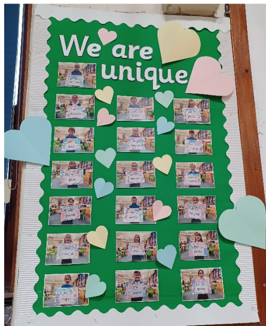
Some of mental health resilience work