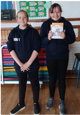
Reading with dogs