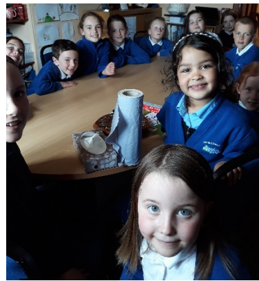
One of our special assemblies