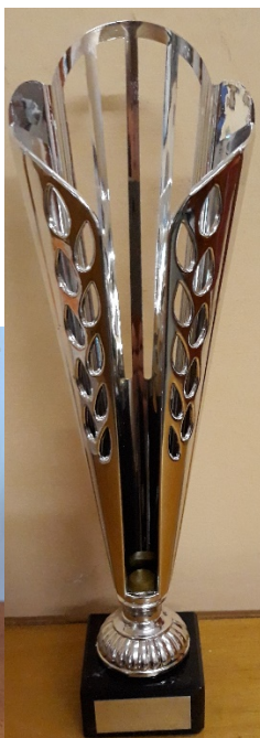
Kindness Cups P1-3 P4-7