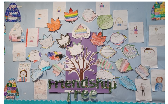
Some of our Kindness and Anti bullying displays