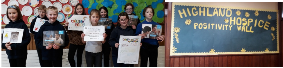
Winning Silver Rights Respecting School Award